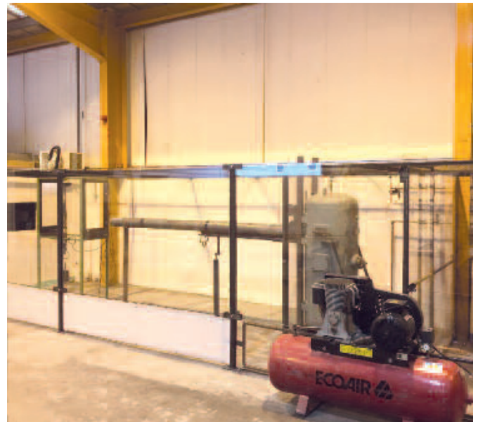
Dellner-Romag have an in-house testing facility for the development of new products

The test facilities include a dedicated air canon capable of propelling impactors to rail industry standards. Custom designed impactors can also be produced on request to specification. Other facilities includes hard body drop and swing tyre impact testing whilst additional test equipment can be designed to specification.