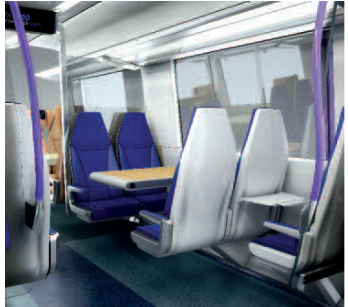
Bespoke glass luggage racks and draft screens for Hitachi

Dellner-Romag is an ISO: 9001 and ISO: 14001 factory, and all our products are fully tested and certified independently to European standards. Our expertise in the rail industry has meant that we have secured design and build contracts with world leading manufacturers including Hitachi Rail Europe, CAF and Bombardier. Dellner-Romag is also preferred supplier to Siemens.