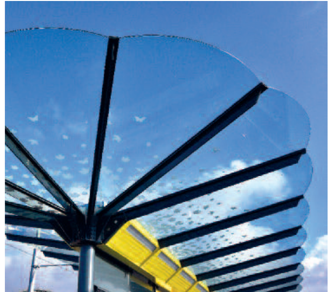
Dellner-Romag printed and shaped glass is an impressive embellishment to this Manchester tram stop

More than 132 sq.m of clear glass laminate was supplied by Dellner-Romag for the Exchange Square stop in the city centre, where it will provide an attractive protective canopy for passengers sheltering from the elements. The final design was specifically produced using 17.5mm toughened heat soaked laminated glass, drilled and shaped.