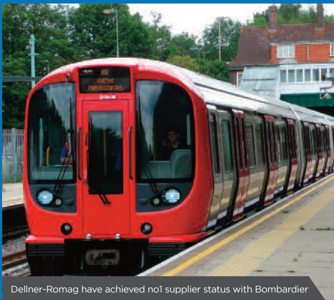
Dellner-Romag have achieved no1 supplier status with Bombardier